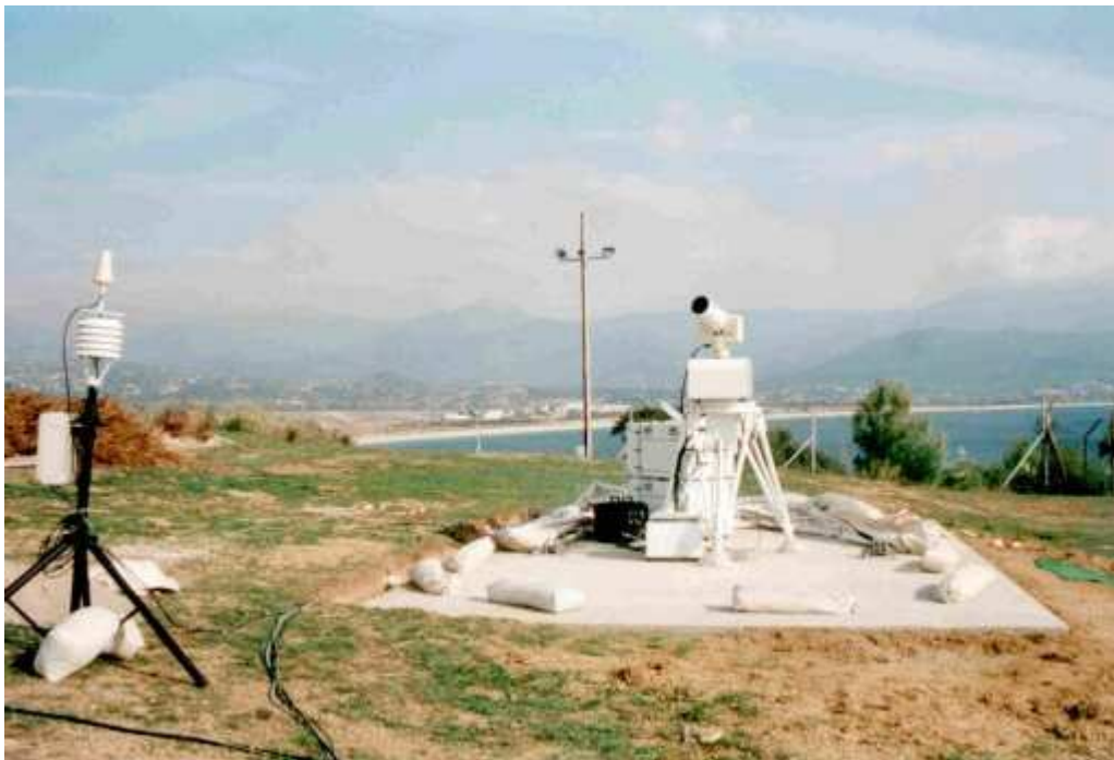
Figure 1 : The French Transportable Laser Ranging Station at Ajaccio (Corsica), 1996/1997.

Among these applications, the FTLRS (figure 1) was developed in order to be able facilitate the installation of a station at low cost nearly anywhere in the world, and also to participate in the calibration of altimetry radar satellites.